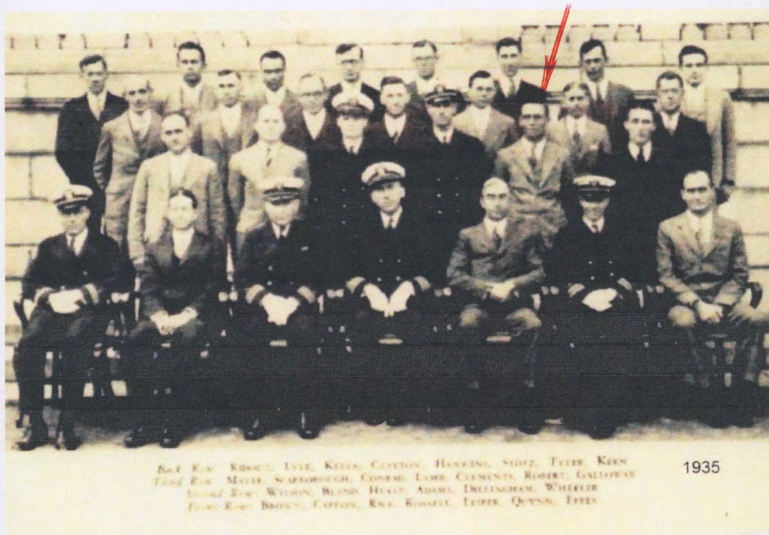
USNA Mathematics Department photo from 1935 Lucky Bag